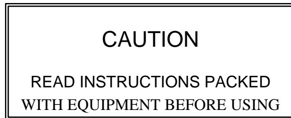
FIGURE 2. Caution plate .

5.3.6 Schematic, wiring, and cable diagram . When these are provided, they shall be in the form of labels or direct marking on a suitable surface of the item.